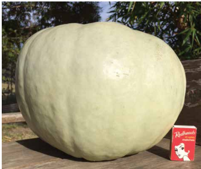
Bronwyn and Wayne's pumpkin