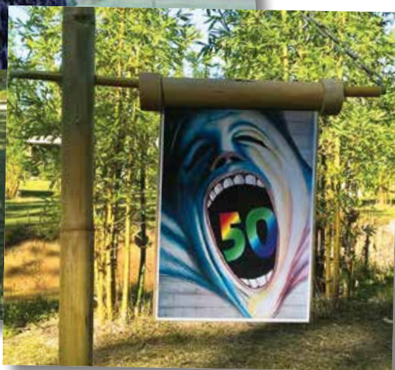
Ralph #50 (twice)