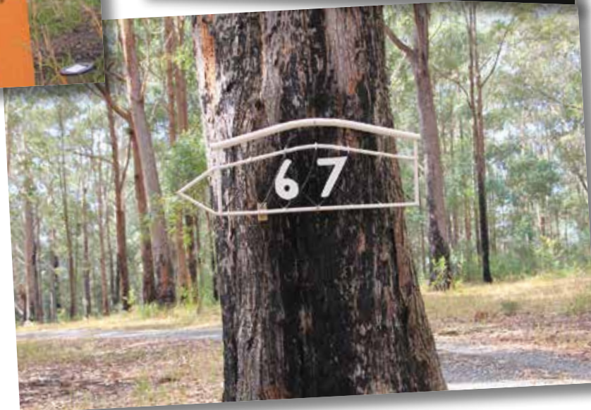
Al Hunter #29