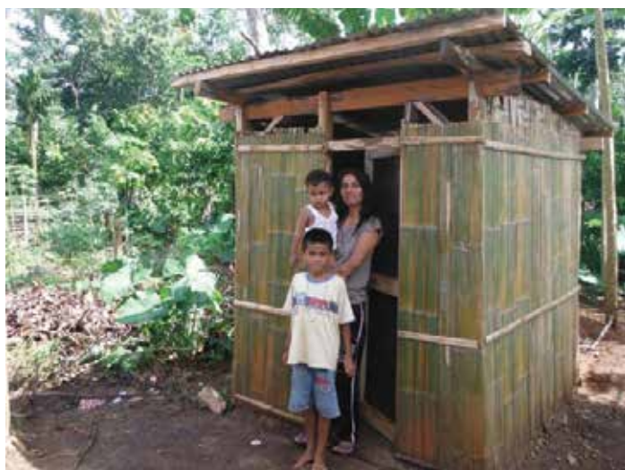
Checking out one of the new toilets: A woman from the village with her boys

The next morning we headed off into the wild west to Ratengaro village in the Kodi district where we were to stay for several weeks. We were welcomed to the village with a chicken dinner. Luke held the legs of the chicken while our host, Martinus, slit it's throat. It was gnarly. The village is very traditional with bamboo houses and thatched roofs reaching 18 metres. We slept on a little mattress under a mozzie net with chickens and roosters